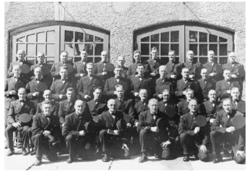
1947 Oakville Volunteer Firemen at 181 Church Street

2018 Notes: 181 Church Street is still standing, but no longer holds the Fire Station. As of October 2018, Church Street is two-way.