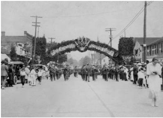
Welcome To Our Boys. Colborne St. (Lakeshore Rd.) c1919

When the Great War of 1914 to 1918 started many young men and women of Oakville joined regiments of their choice, but the majority of them went overseas with the Halton and Dufferin Regiment. This regiment, part of the Canadian Expeditionary Force was mobilized and went to Europe in April of 1917.