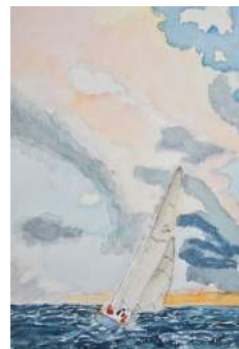
Art Contest Winner

The Oakville Historical Society has in the past been involved in putting on activities for young visitors. The Boating Display a few years ago included a number of age-appropriate activities such as: find the baby ducks, locate specific items in the display and solve a complex navigation exercise. There was even an art contest with some pretty good prizes. The most valuable was free registration for art lessons. The Mayor's Picnic has for the last couple of years included a sort of scavenger hunt.